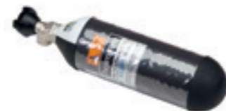
Air Bottle HAB 01 ST

* meets bullet test according to EN 12245