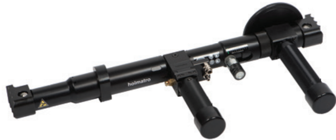
HDB 90 ST