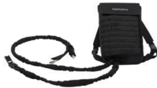
HDB P 240 ST (WO)

To be used in combination with one of the Door Blaster Packs.