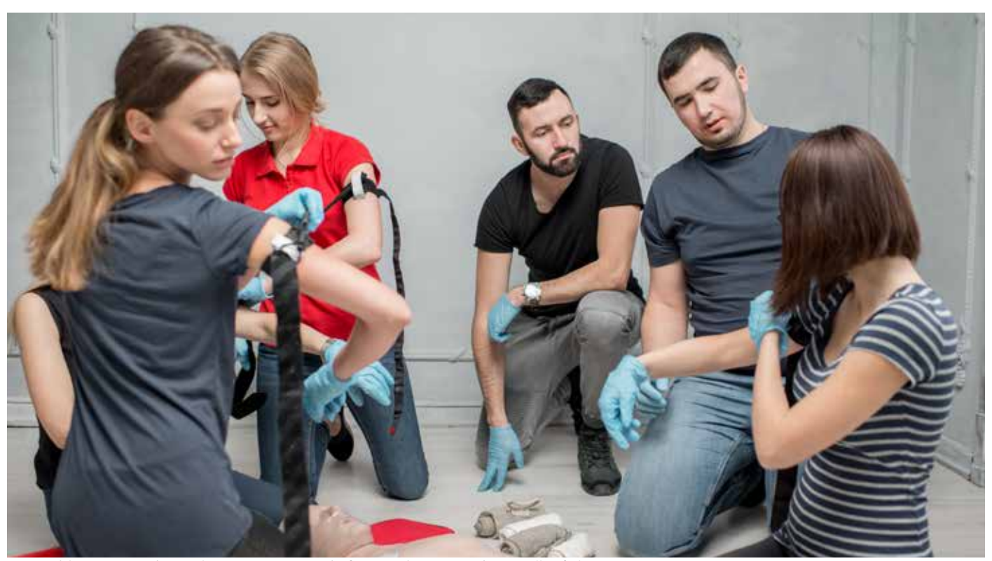
Being able to train with a real tourniquet instead of pretending it was there, will safe lives.

At AP Services we believe in qualifications, values, experience and the will to learn, upon everything else. We do not judge upon gender, sexuality, race, political or religious beliefs.