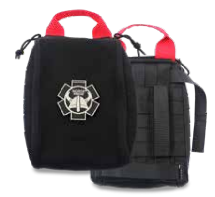
Velcro front enables personalized patches (sold separately).